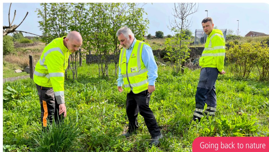
Going back to nature

We've never had a chance to see these flowers before as they're cut before they can establish themselves. It's about going back to basics."