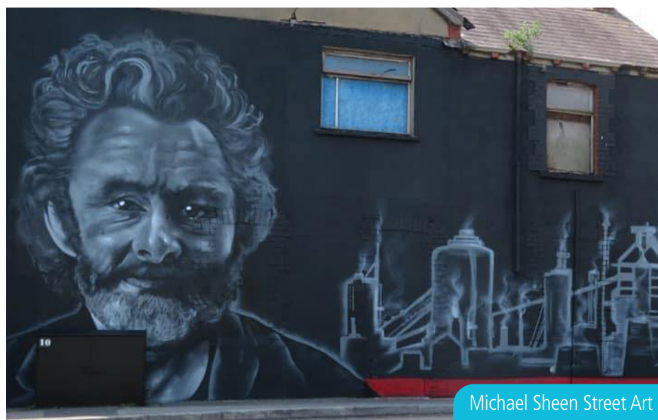
Michael Sheen Street Art

The mural also includes sheep, as we are using their wool to insulate properties at the redevelopment.