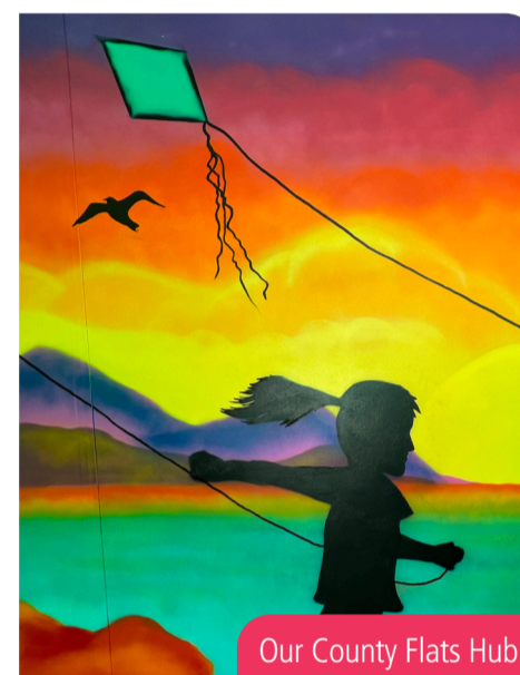
Our County Flats Hub